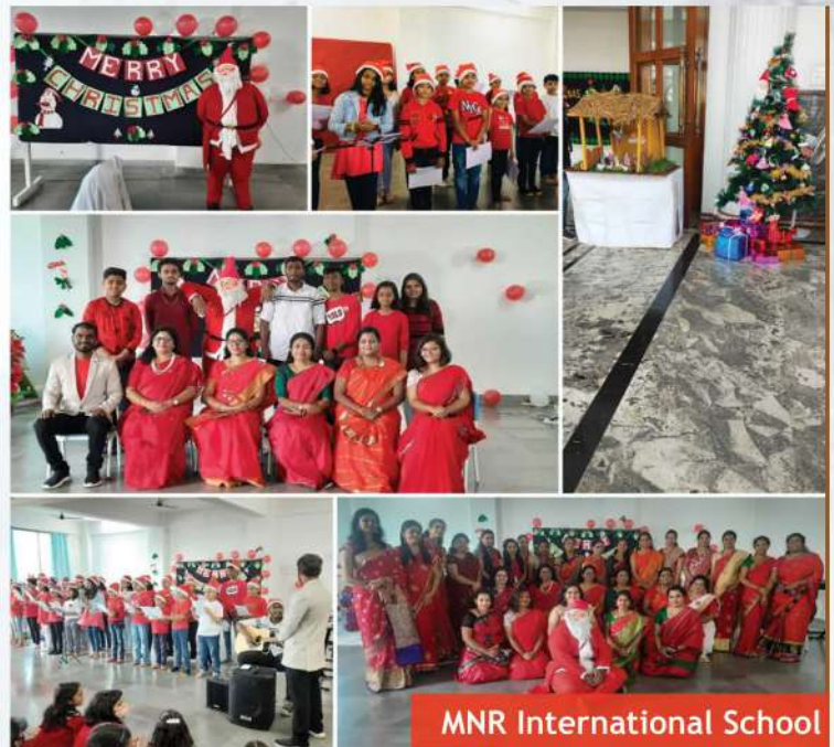
MNR International School