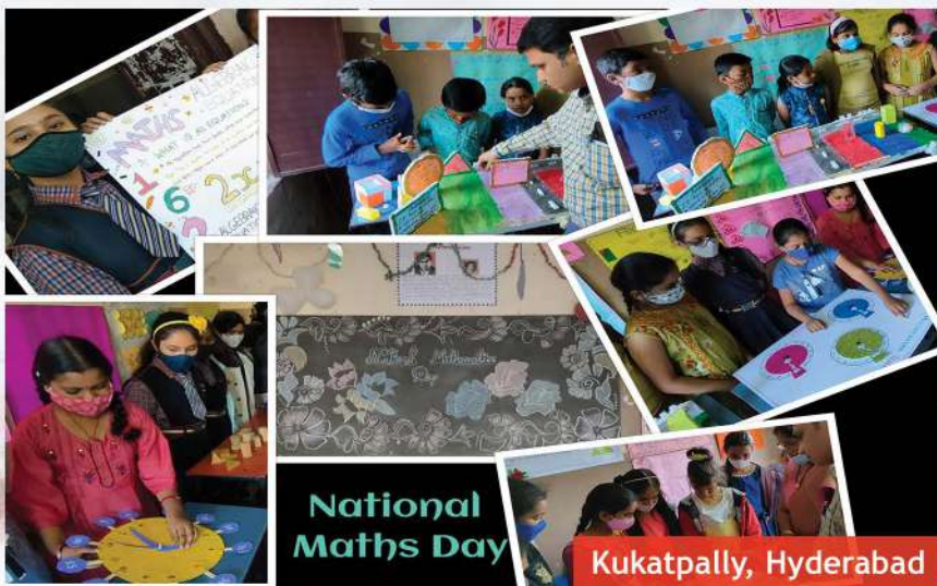
National Maths Day