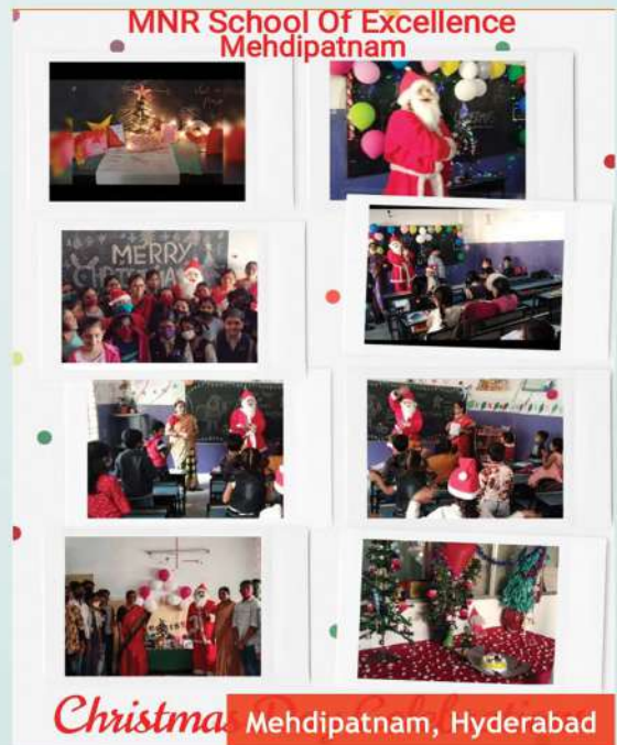
Christmas Mehdiapatnam, Hyderabad