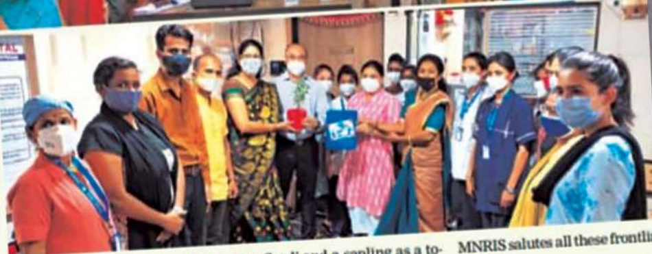
ment. The medical team and the police staff were given a 'Thank You Card' and a sapling as a token of respect and appreciation. MNRIS salutes all these frontline warriors.